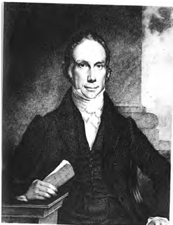
Statua Anderssonius 1857